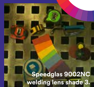
Speedglas 9002NC welding lens shade 3.