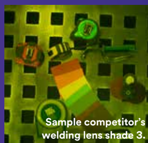
Sample competitor's welding lens shade 3.